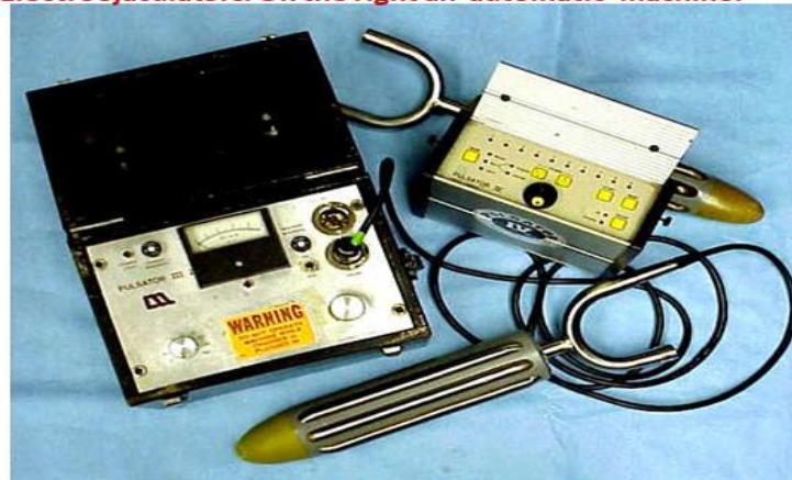
Electroejaculators. On the right an 'automatic' machine.